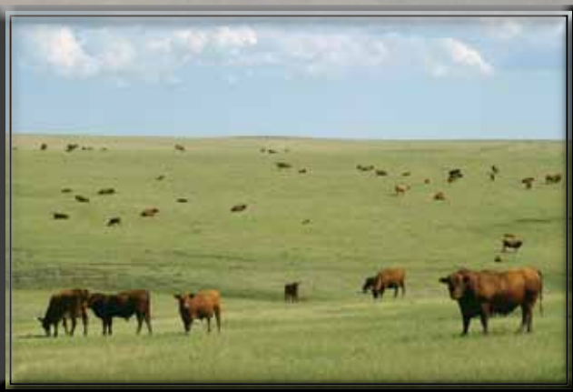
Purdy Ranch, Elbert County

The Colorado Cattlemen's Agricultural Land Trust (CCALT) had another banner year in 2010. The Land Trust partnered with landowners in the protection of over 20,000 acres and 34 transactions in 2010. This means CCALT has protected a total of 370,000 acres as of December 31, 2010 in over 37 counties across Colorado!