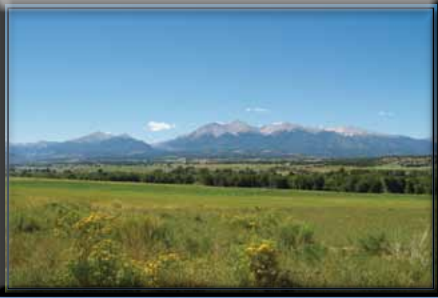
Hutchinson Ranch, Chaffee County